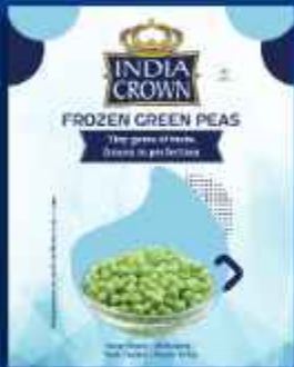
FROZEN GREEN PEAS