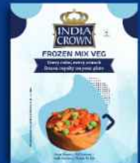
FROZEN MIX VEG