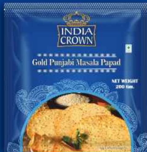
GOLD PUNJABI MASALA PAPAD