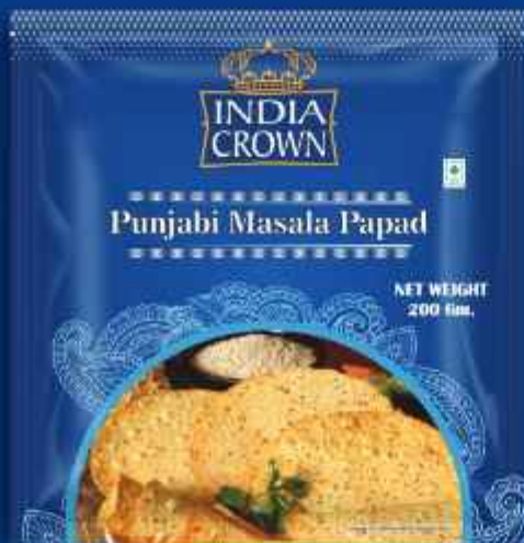
PUNJABI MASALA PAPAD