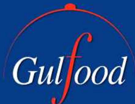
•Gulf Food, Dubai