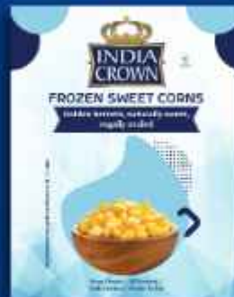
FROZEN SWEET CORNS