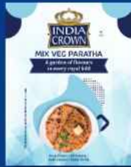
MIX VEG PARATHA