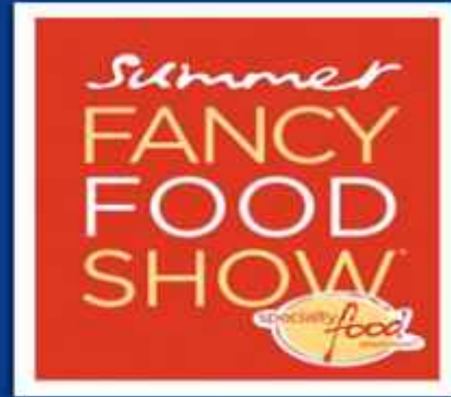
•Fancy Food Show, USA